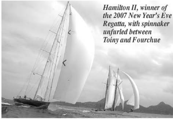
Hamilton II, winner of the 2007 New Year's Eve Regatta, with spinnaker unfurled between Toiny and Fourchue