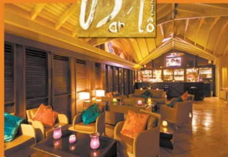
The restaurant will be open this summer except on Monday and Thursday