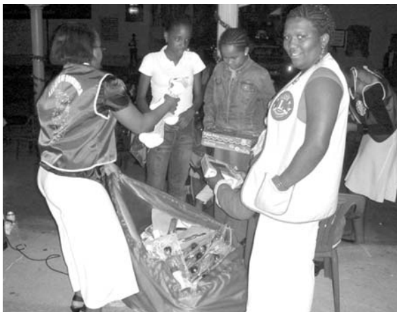
Distribution of Gifts to Children at Carols by Candlelight, December 13, 2007

On December 5, 2007, the Lions Club in Dominica was pleased to receive a 20' container sent by the Lions Club of Saint Barthélemy. Inside were donations of clothing, mattresses, linen, household goods, and shoes, as well as a large number of toys for the poorest sector of the population on this island in the Antilles archipelago. Very moved by these donations, the Lions Club in Dominica sent a complete report to the Lions Club in Saint Barth, noting that the