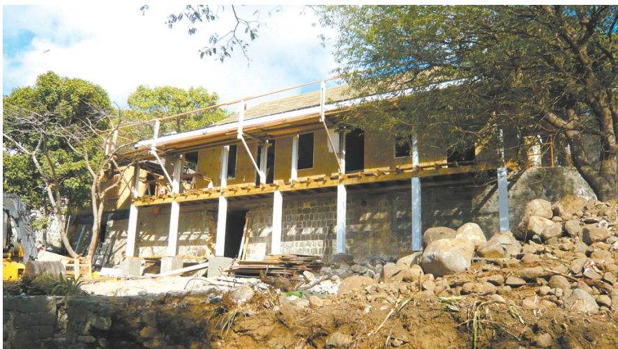
Started last November, renovation continues at the Catholic rectory in Gustavia.

Gustavia: the church hall, also known as "café chaud," is under total renovation. It should be completed in mid-May when it will be used as a performance venue for the theatre festival, which takes place May 16-25. Other than the addition of air conditioning, the renovation centered around the stage. Its wooden floor is being varnished. Control for lighting and sound has been added on the mezzanine and the Collectivity has ordered theatrical lighting fixtures and is waiting for the EDF to agree to add additional amps (3 x 50 amps) so that the equipment can function properly. Phase two includes making the auditorium bigger: at this time only 150 people can be seated in this new performing arts venue.