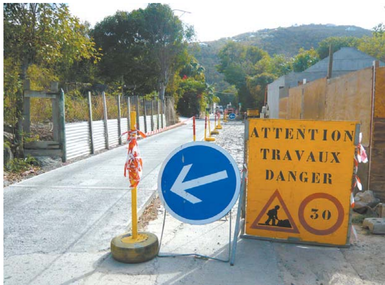
Repaving of the road in Flamands is nearing completion

► Gustavia: started last November, the renovation of the rectory continues. The project was slowed