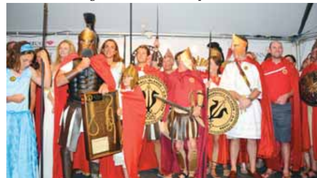
The crew of Axia, winners of the Skullduggery Award.