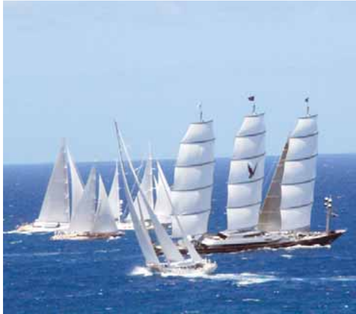
Too close for comfort?