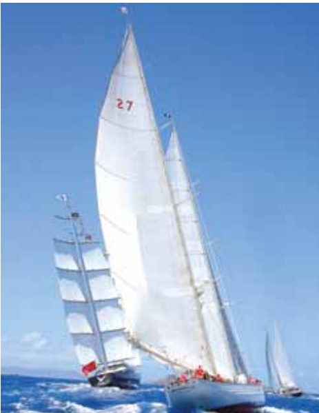
During the second day of racing, a duel of titans between Adela and Maltese Falcon