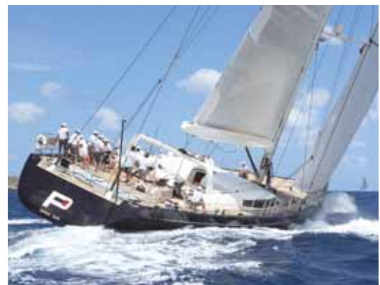
The first Bucket outing for P2, a new generation of Perini Navi racing yachts