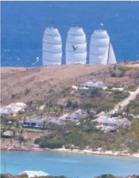
Maltese Falcon—a real attention getter