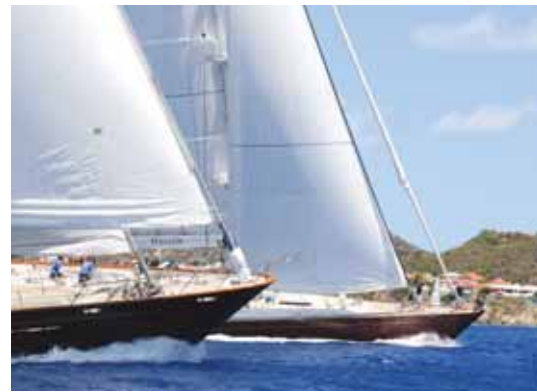
Two beauties nose to nose