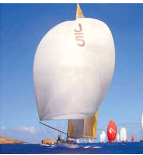
Ranger speeding along with spinnaker unfurled