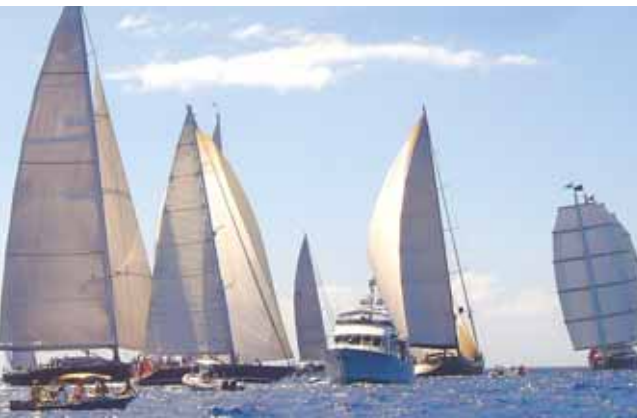
A close finish on Sunday during the last race