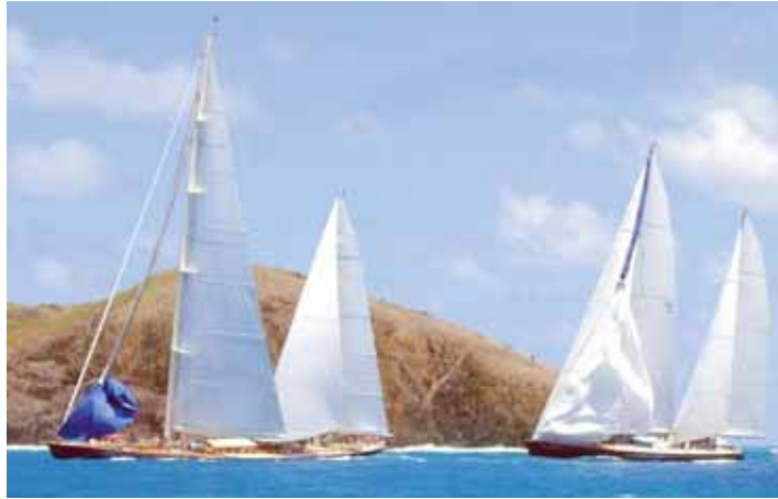
Spinnakers unfurl near Frégate