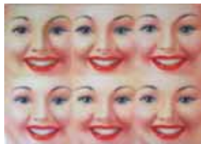
photo perfectness —have strange eyes and thus become grotesque, the same smiles repeated over and over again turn fake, perfectly posed women admiring a bouquet of flowers —black flowers.

Steven Guermeur at b.art Gallery, Gustavia.