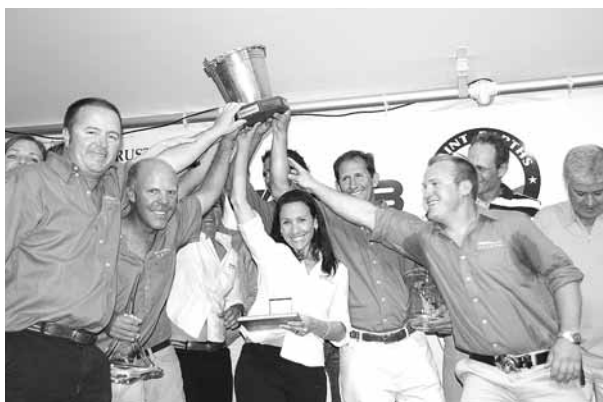
The crew of Meteor, which won the 2009 Bucket and took first place in the Grand Dames class.

Camper Nicholson Yachts had generously donated 12 small Vanguard sailboats to the St Barth sailing school after last year's Bucket, and this year the kids from the school raced in a junior-Bucket with British sailor and double Olympic Gold Medalist Shirley Robertson on hand to give out the awards. In continued support of the children on the island, this year, the Bucket organizers donated 17,500 Euros, or 10% of the entry fees from the race to the junior high for new computers. “Our computers are