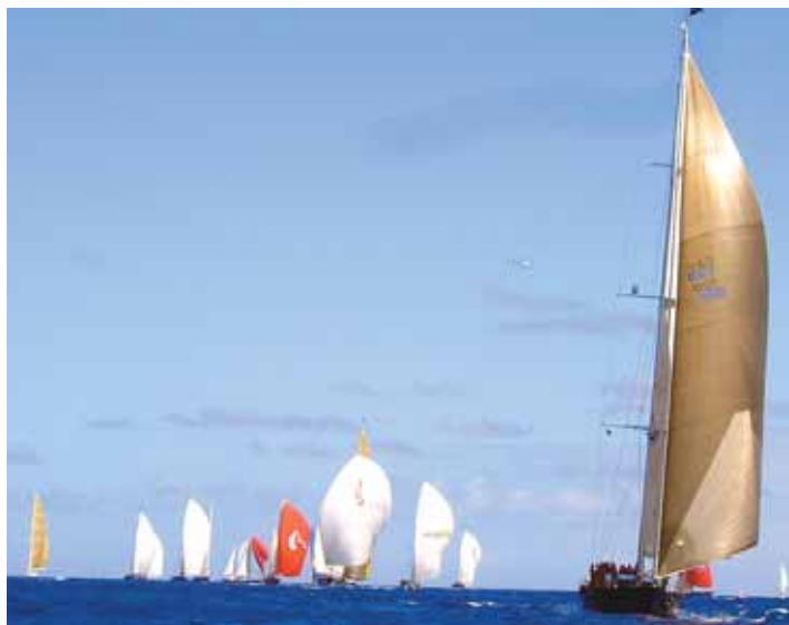
The fleet with its colorful spinnakers between Toiny and Fourchue