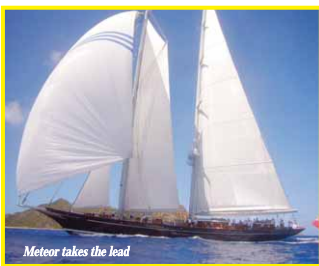
Meteor takes the lead