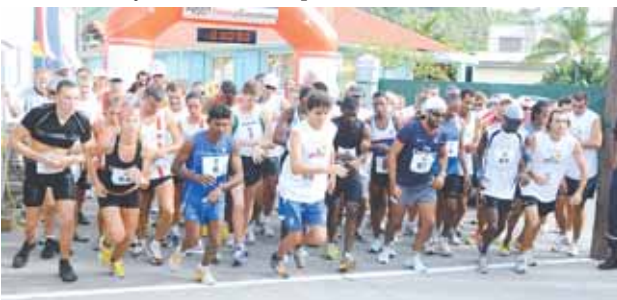
Start of the Aces race.