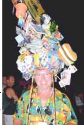
A Parrot Head, or Jimmy Buffett fan, who follows the singer from concert to concert.