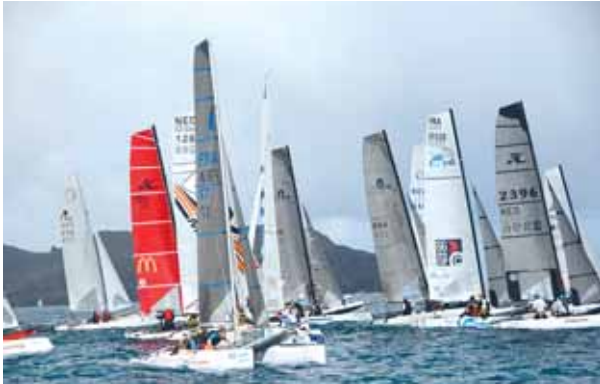
On the starting line