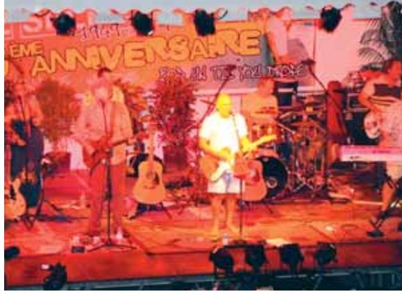
Saturday, November 7, showtime for Jimmy Buffet and the Coral Reefer Band... A Sold-Out Dock!