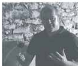
Château Maris Minervois Languedoc