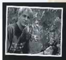
Château de Fosse sèche Saumur Val de Loire