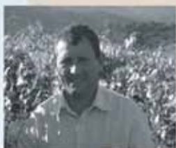
Domaine Abbatucci Ajaccio Corse