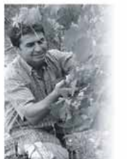
Clos St Vincent Bellet Provence