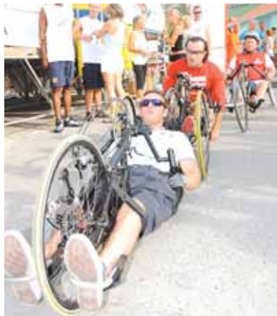
Three handcycles in the race!