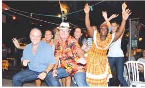
The first Christmas songs of the season: a "Chanté Nwel" was held on Saturday, November 28 at The Wishing Well restaurant in Flamands. Flamands. Pronounced "Shantay Nwell," this Creole phrase literally means "Singing Christmas (carols)."