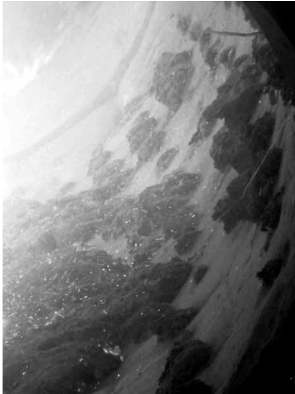
While the walls of the incinerator should be clean and its air vents open, today they are clogged by glass paste that accumulates after burning a large number of bottles carelessly thrown into household trash.

A new communications campaign intended to make recycling a top priority is on the island's agenda, as the lack of