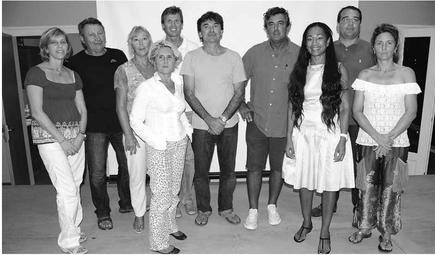
The organizational committee for Les Voiles de Saint Barth

For the first edition, the CTTSB has contributed 100,000 euros toward the total budget of 265,000