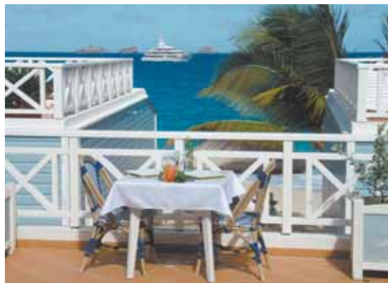
Hôtel Baie des Anges • Flamands • 0590 27 63 61

Lobsters Fresh From The Tank 100 g for 6, 50 euros