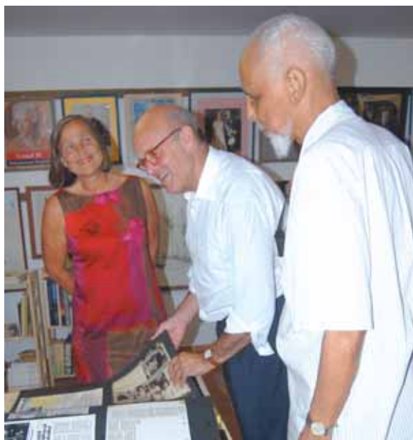
Visit to the Marius Stakelborough Museum in Gustavia. © Edmund Gudenas