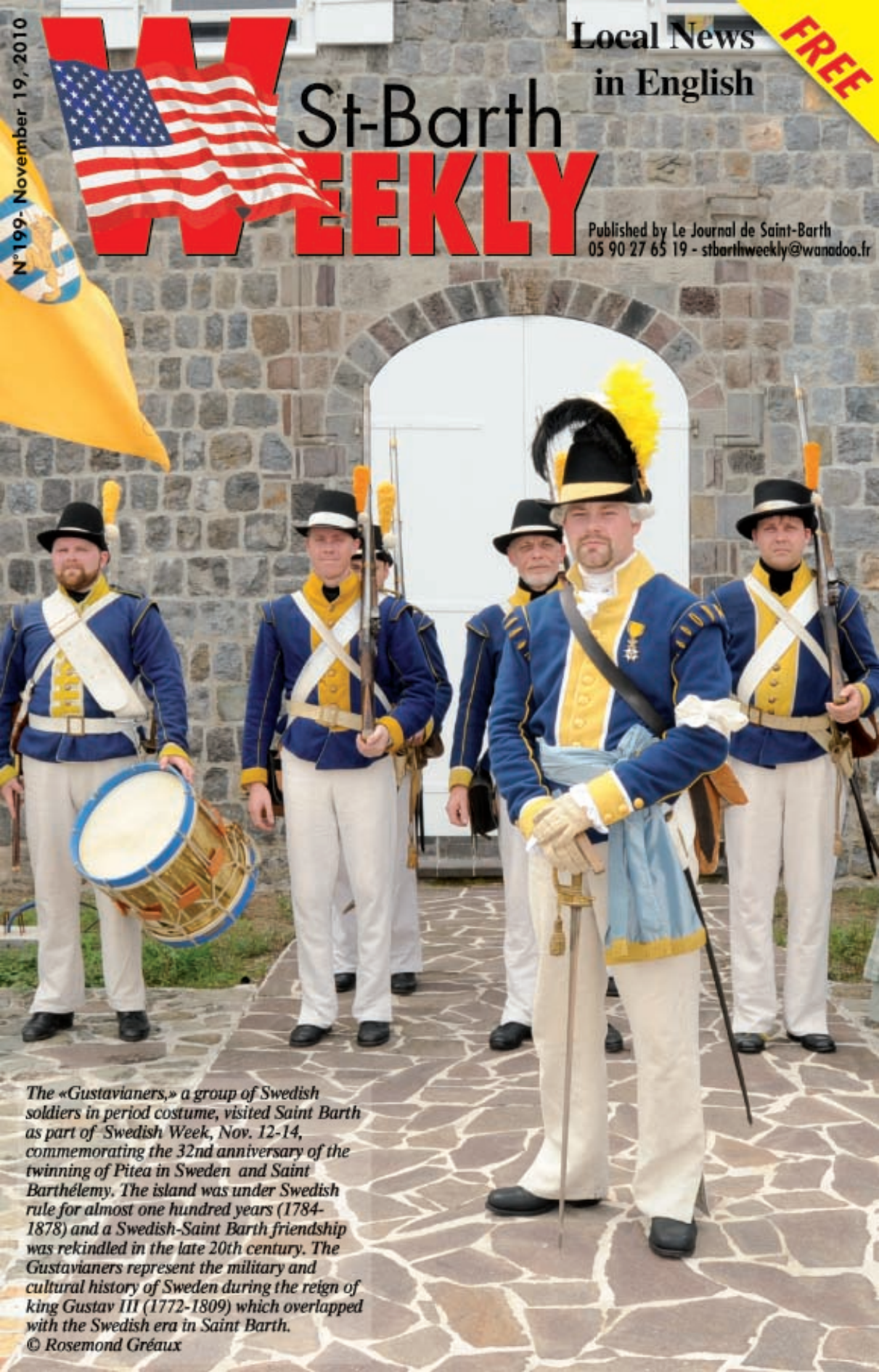
The «Gustavianers,» a group of Swedish soldiers in period costume, visited Saint Barth as part of -Swedish Week, Nov. 12-14, commemorating the 32nd anniversary of the twinning of Pitea in Sweden and Saint Barthélemy. The island was under Swedish rule for almost one hundred years (1784-1878) and a Swedish-Saint Barth friendship was rekindled in the late 20th century. The Gustavianers represent the military and cultural history of Sweden during the reign of king Gustav III (1772-1809) which overlapped with the Swedish era in Saint Barth.

Published by Le Journal de Saint-Barth 05 90 27 65 19 - stbarthweekly@wanadoo.fr