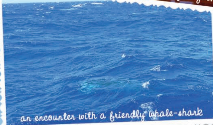
an encounter with a friendly whale-shark