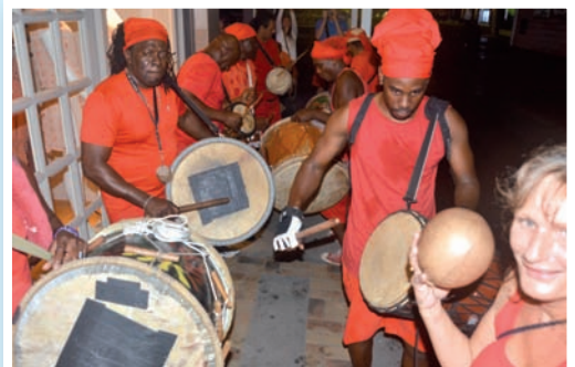
Red costumes as La Pointe en Mouvement prepares for Carnival.