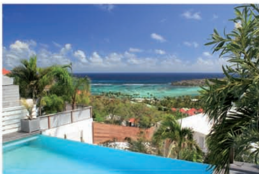
Villa GLT - 3 bedroom villa with pool, close to the lagoon and the sheltered Marigot bay. € 1 600 000