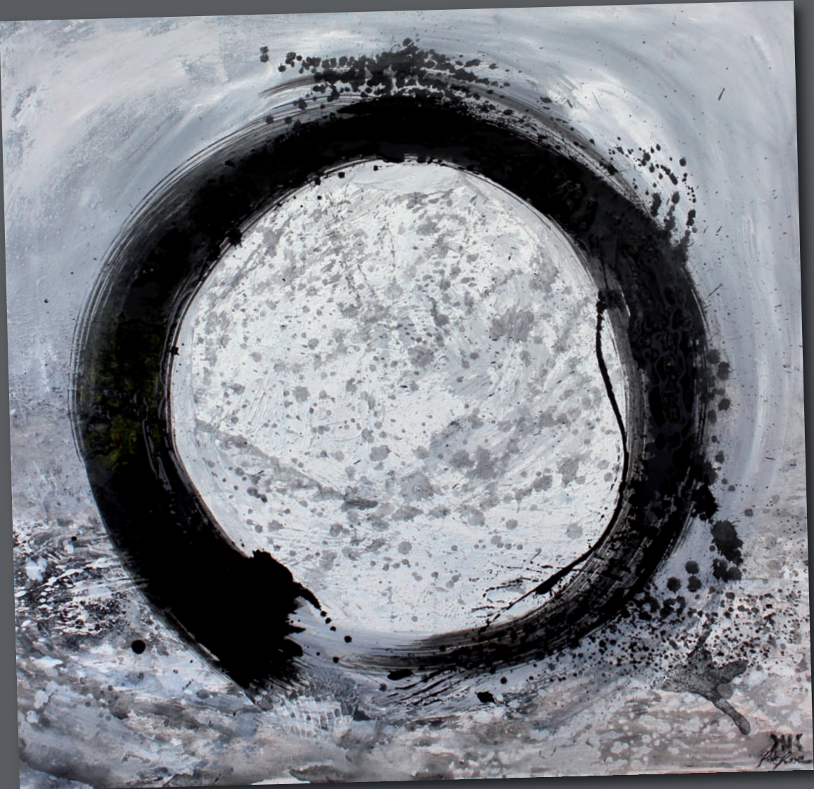
Enso by Kate Kova - Acrylic, ink, mixed medias on canvas - 2015

Published by Le Journal de Saint-Barth 05 90 27 65 19 - stbarthweekly@wanadoo.fr