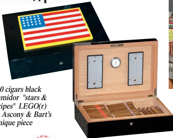
110 cigars black humidor "stars & stripes" LEGO(r) by Ascony & Bart's Unique piece