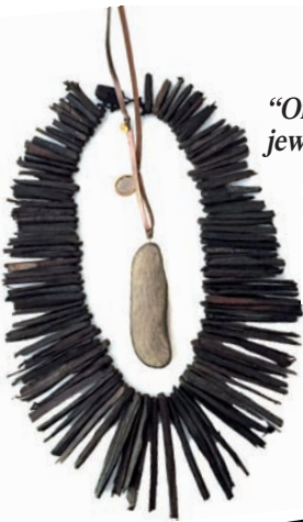
"Organic one-of-a-kind jewelry at