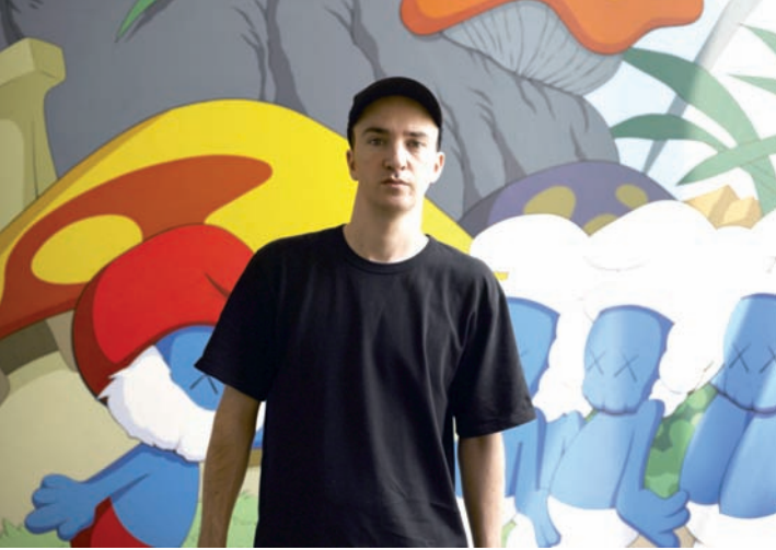
Brian Donnelly, aka KAWS,

A St Barth regular for more than ten years, Brooklyn-based artist KAWS returns for his second solo show at Eden Rock Gallery, November 29 through December 26, in collaboration with Galerie Perrotin and Art Saint Barth. A follow up from last year's exhibit in Saint Barth, the Brooklyn-based illustrator, sculptor, and graffiti artist runs the gamut of pop subjects including the iconic Peanuts characters.