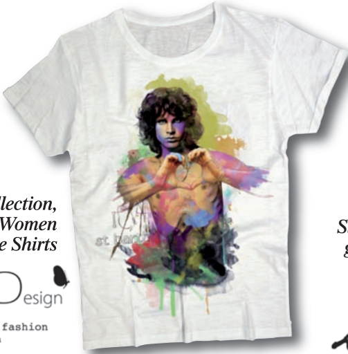
Iconic Collection, Men & Women Tee Shirts