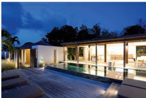
Villa RRU - Amazing charm, great privacy and a privileged location, 3 beds. € 5 500 000