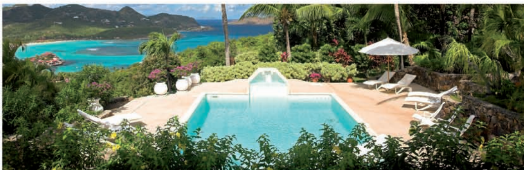
Villa ADO - A sumptuous colonial villa with an extraordinary setting, 4 beds. € 10 900 000