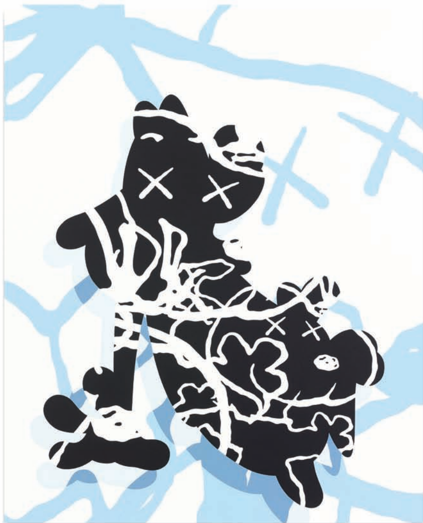
KAWS, Untitled, 2015, Acrylic on canvas, 74 x 60 in, Courtesy Galerie Perrotin

OPENING RECEPTION SATURDAY NOVEMBER 28, 2015 - 6PM - 9PM EXHIBITION FROM 29 NOV - 26 DEC 2015