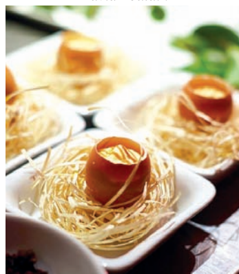
Egg - Sweetcorn - Cumin under a tree.

The first wine was an Italian white Greco di Tufo; the two fish courses were accompanied by a French Vieilles Vigne Chablis. The dessert wine was a sweet Italian Muscato. Taiwana deserves credit for their good service, especially with a full dining room where a lot of people arrived at the same time. With a nice breeze from Flamands Beach, it was the perfect place to be introduced to the innovative cuisine of David Toutain.