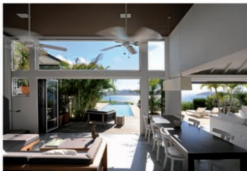
Villa DKD - This Pointe Milou villa is designed for a perfect lifestyle, 2 beds. € 5 975 000