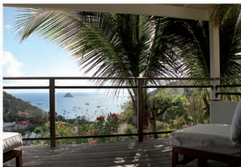
Villa NOR - This ideally located charming hillside villa boasts a picturesque sea view, 2 beds. € 2 700 000