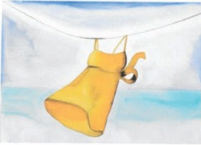
Francesco Clemente, After Omeros XXIII, 2015. Watercolor on paper, 14 1/8 x 20 inches

Continuing its exhibits of work by internationally acclaimed contemporary artists, the association Saint Barth Ile d'Art (Saint Barth Island Of Art) presents paintings by Francesco Clemente, from November 28, 2015 through March 23, 2016 at the Territorial Museum in the historic Wall House in Gustavia. Last year, the focus was on Jasper Johns. Both artists have ties to Saint Barth, as frequent visitors who have created work on the island. Clemente's exhibit is inspired by Caribbean author Derek Walcott from Sainte Lucia, winner of the Nobel Prize for Literature in 1992.