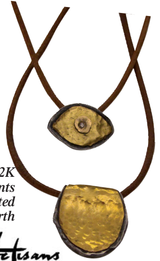
Silver and 22K gold pendants handcrafted in St. Barth