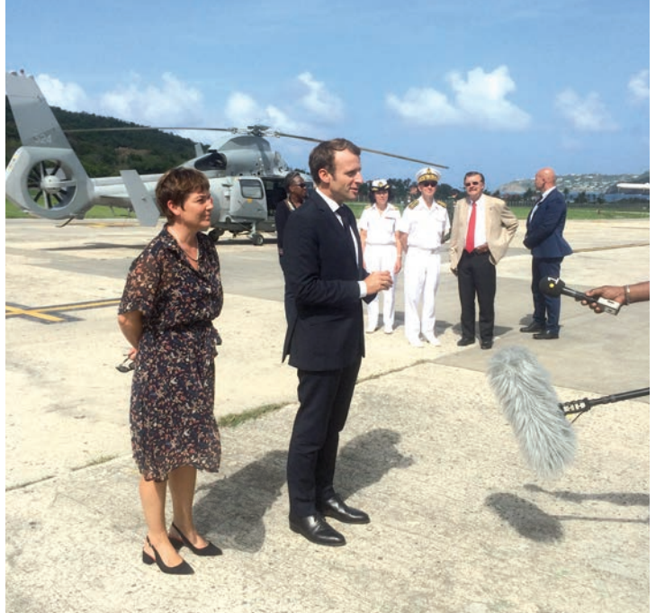
French president Emmanuel Macron cited the “exemplarity” of Saint Barthélemy post-Irma.

He then had lunch at Esprit Jean Claude Dufour in Saline, with some of the island’s elected officials and decision makers. Next, at the Espace Météo near the lighthouse in Gustavia, Macron met with 30 or so island residents whose work was influential in the rapid recovery of Saint Barthélemy after Irma: business leaders, doctors and nurses, school principals, the director of the port, gendarmes, police, firemen, representatives of EDF...Macron thanked everyone and exchanged a few words with them before leaving for Paris.