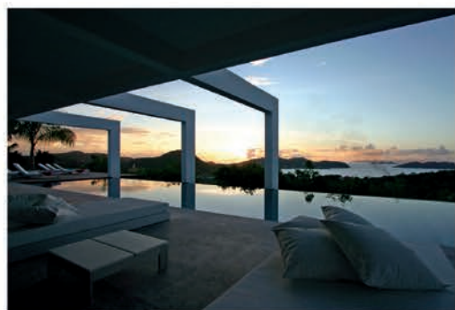
Villa AGA - Modern villa with great indoor & outdoor living areas, superb views. 2 beds, 0.286 acres. € 3 250 000