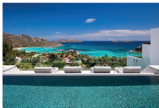
Villa IDA - Breath taking views over St Jean bay and spacious living areas, 3 beds, 0.218 acres. $ 7 300 000