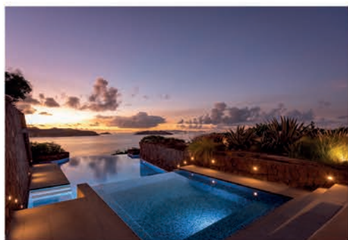
Villa SIX - Unique Pointe Milou villa, spacious outdoor living and infinity pool overlooking ocean views. 3 beds, 0.611 acres. € 6 900 000