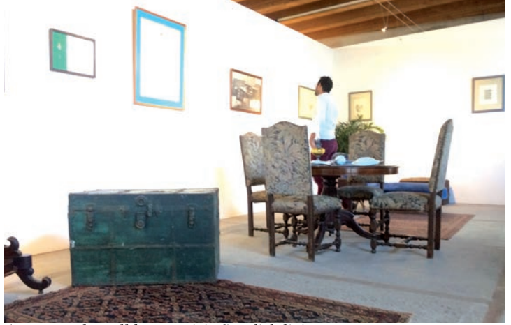
A recreated small bourgeoisie Swedish living room

The protagonists of the friendship between Saint Barth and Sweden,