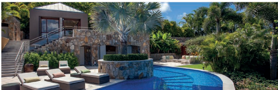
Villa LGM - Mini resort style property in the ultra-exclusive Lotissement "Les Etoiles", 9 beds, 2.124 acres. Price upon request