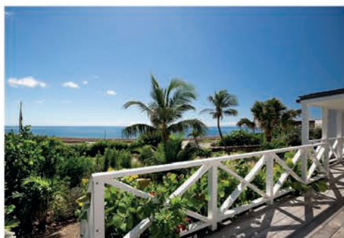
Villa DLX - Renovated traditional style villa on the wild coast, sea views, great potential. 1 bed, 0.42 acres. € 2 200 000