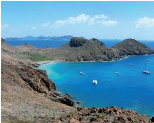
The island of Forchue and its bay in 2009, after five years without goats.

Questel K & Hochart J. 2019: "Recovery of vegetation on the island of Fourchue (Saint Barthélemy) following the suppression of goats. ATE Bulletin N°4. 2-6.