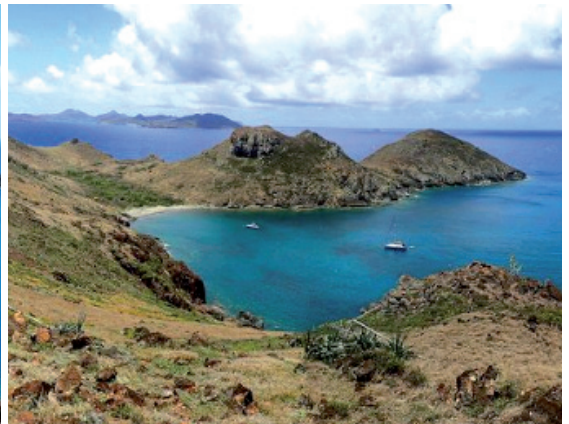
The same spot in 2016, after 12 years.