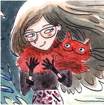
Self-portrait of the illustrator.