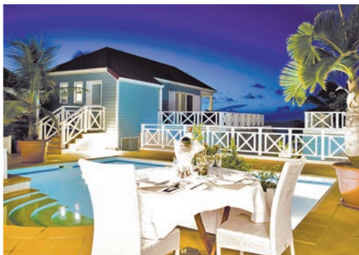
Hôtel Baie des Anges • Flamands • 0590 27 63 61

Lobsters Fresh From The Tank 100 g for 8,00 euros