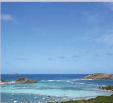
Blue Lagoon - 7 Bedrooms - Grand Cul-de-Sac - € 4,255,000