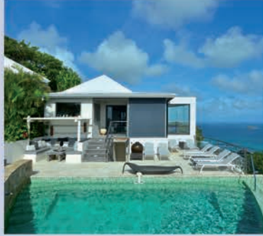
Chiavari - 5 Bedrooms - Lurin - € 6,900,000