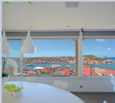
Opale - 2 Bedrooms - Gustavia - € 2,700,000