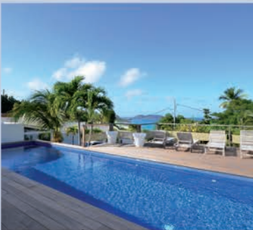
Nine - 4 Bedrooms - St. Jean - € 3,300,000