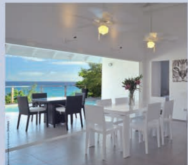
A Bientot - 2 Bedrooms - Toiny - € 2,500,000

Visit us in our new Gustavia office (next to Bagatelle and Baz Bar)