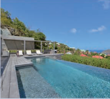
Casawapa - 4 Bedrooms - Colombier - € 5,300,000

Welcome and good luck to all of the St. Barths Bucket Competitors.