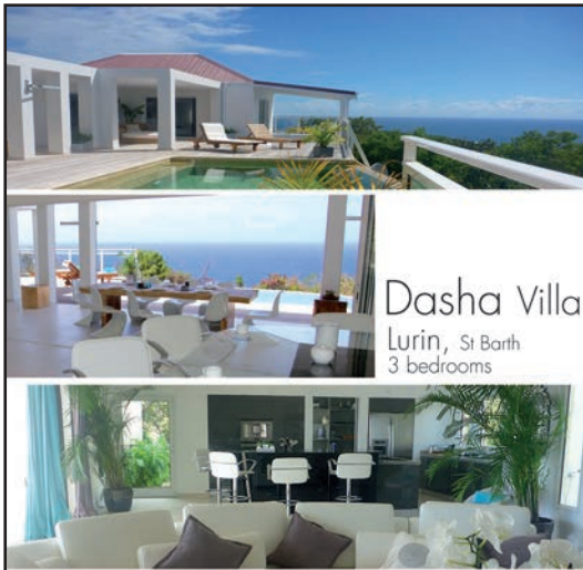
Dasha Villa Lurin, St Barth 3 bedrooms

Sotheby's International Realty 0590 29 90 10