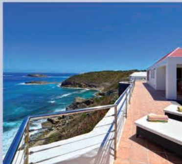
Henri Bay - 4 Bedrooms - Pointe Milou - € 5,000,000