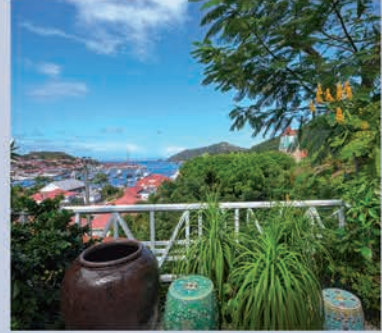
Colony Club - 1 Bedroom - Gustavia - € 1,900,000