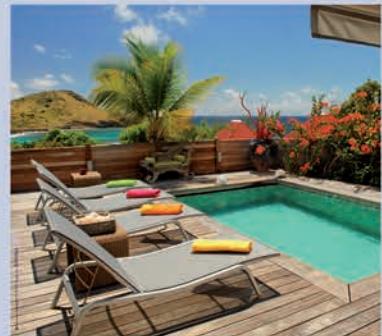
Bet Yam - 3 Bedrooms - Toiny - € 2,200,000