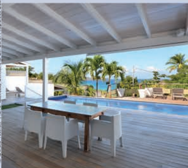
Villa - 4 bedrooms - St Jean - €3,300,000