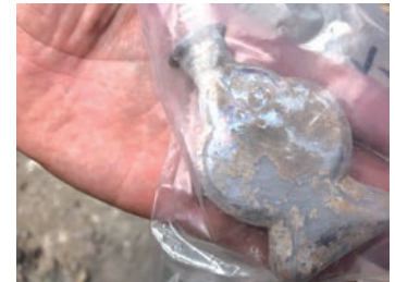
A pearly glass flask

The archeological dig has revealed layers of different colors (seven seen here) in the earth. This stratigraphy allows the different époques to be defined.