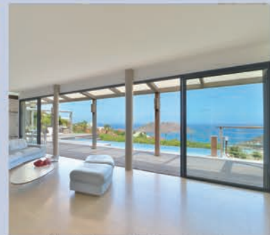
Villa - 4 bedrooms - Colombier - €4,800,000