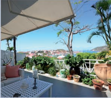
Apartment - 1 bedroom - Gustavia - €1,900,000