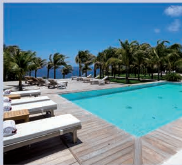
Villa - 6 bedrooms - Petit-Cul-de-Sac - Price on request