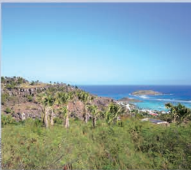
Land - Vitet - €1,596,000