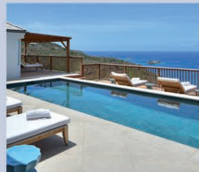
Villa - 3 bedrooms - Colombier - €11,500,000

Visit us in our new Gustavia office (next to Bagatelle and Baz Bar)