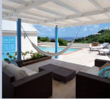
Villa - 2 bedrooms - Marigot - €4,000,000