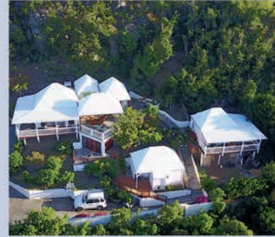
Villa - 3 bedrooms - Petit-Cul-de-Sac - €2,950,000