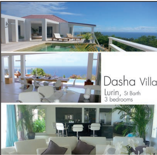
Dasha Villa Lurin, St Barth 3 bedrooms

St. Barth Properties Sotheby's International Realty - 0590 29 90 10 - sothebys@stbarth.com