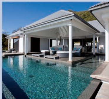
Villa - 3 bedrooms - Vitet - €4,250,000