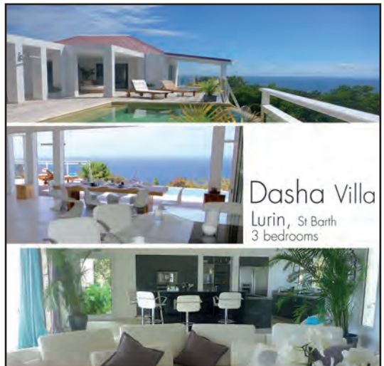
Dasha Villa Lurin, St Barth 3 bedrooms

- Antoine Heckly Art-Gallery - Clic Gallery, Gustavia - Les Artisans, Gustavia - Camaruche Gallery - SpaceSBH Gallery - Pipiri Palace, Gustavia - Pati's Gallery, by Artists of Saint-Barth