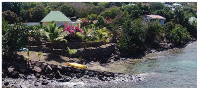
Land KEN - EXCLUSIVE - Marigot 6,700,000 € Rare opportunity. Buildable land with direct access to Marigot bay. Lot size 2077m 2 .