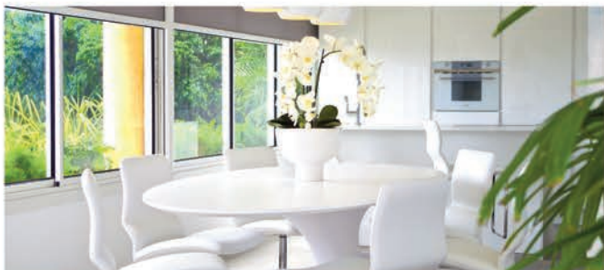
Apt LJA - 2 BR - Gustavia 2,700,000 € High in Gustavia, contemporary 2 bedroom apartment offering beautiful views over the harbour. Close to town center.