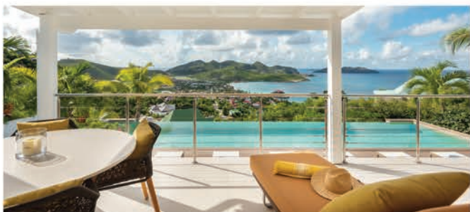
Villa LLA - 4 BR - St. Jean Hillside 9,900,000 € Recently fully renovated 4 bedroom villa on a 1510m 2 lot on the popular hillside above Nikki Beach in St. Jean. Stunning ocean and sunset views.