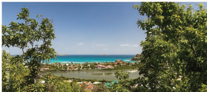
Land HAZa / HAZb - St. Jean 2,889,000 € Each Lot sizes: 1338m 2 and 1337m 2 Two buildable lots with ocean views above the beautifully renovated pond at an affordable price. Each will allow for a villa with fantastic views, or combine the two for your St. Jean estate.