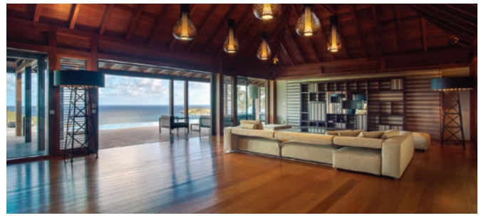
Villa JOY - 5 BR - Mariaot 12,800,000 € This villa enjoys a beautiful view of Marigot bay. The modern design is accentuated with clean lines and the interior is finished with natural materials, including wood ceilings and floors. Gourmet kitchen, large rooms, pool, air conditioned bedrooms. Price is negotiable.