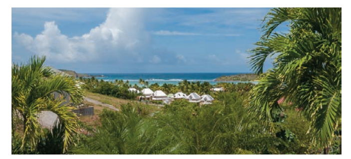
Villa CBA - 2 BR - Grand Cul de Sac 3,900,000 € Surrounded by stone walls and lush vegetation, Villa Palm is meticulously maintained, with beautiful views of the lagoon and ocean. Parking in front as well as in a garage underneath. Price is negotiable.