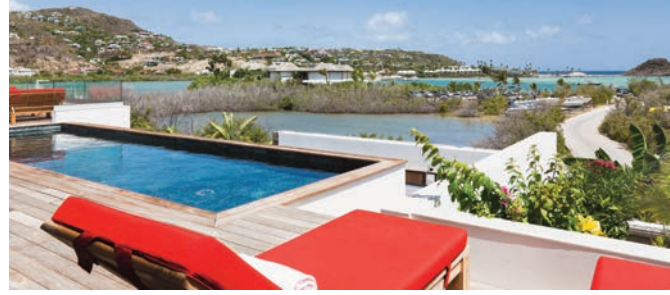
Villa CBI - 4 BR - Grand Cul de Sac 5,300,000 € Newly built villa. Fully furnished with nice views of the lagoon. Great rental potential!