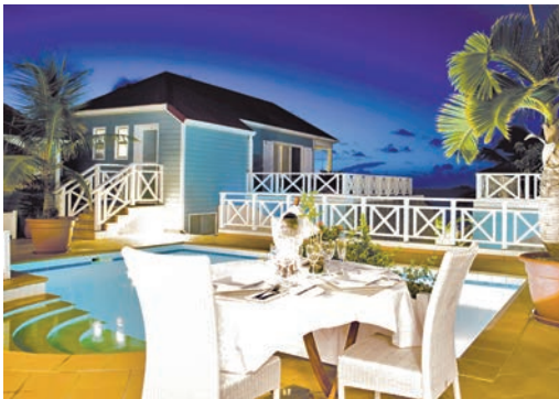
Hôtel Baie des Anges • Flamands • 0590 27 63 61

Lobsters Fresh From The Tank 100 g for 8, 00 euros