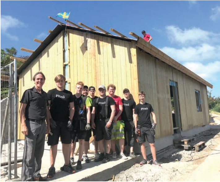
The Swedes show off their traditional skills as builders, while adapting Scandinavian construction techniques to a tropical climate beset by hurricanes.