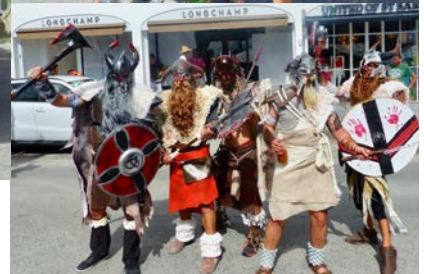
Other photo on the Facebook of Le Journal de Saint-Barth