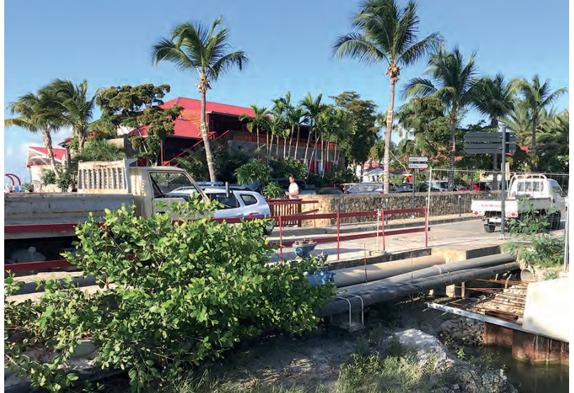
Once the traffic lanes are widened at the intersection, pipes and cables will be moved so that the bridge can be demolished and rebuilt.

The first phase of this project: widen the roadway for vehicles at this intersection by the stop sign on the road that leads to Eden Rock from the salt pond in Saint Jean. Then in early May, the section of the road in front of the hotel's parking lot will be closed, with a detour in both directions around the pond. Work to displace all of the various cable and pipe