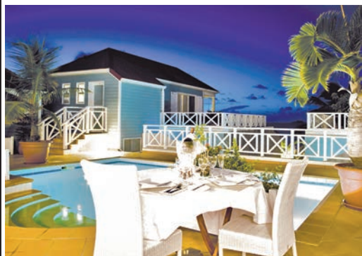
Hôtel Baie des Angés • Flamands • 0590 27 63 61

Lobsters Fresh From The Tank 100 g for 8,00 euros