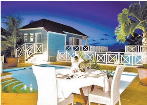
Hôtel Baie des Angés • Flamands • 0590 27 63 61

Lobsters Fresh From The Tank 100 g for 8,00 euros