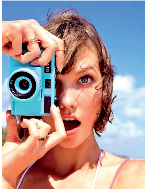
Photographs by Ben Watts and Greg Kadel are part of the Art Week Photo Festival.

The third edition of Art Week features ten internationally acclaimed fashion photographers whose work will be shown at ten of the top island hotels.