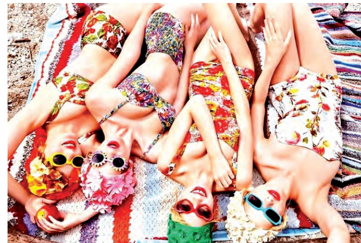
An image by Ellen Von Unwerth.

For additional information: www.sbhartweek.com