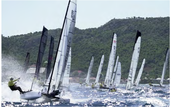
For four days, 66 F18 sport catamarans competed in the waters around Saint Barth.

“We are super happy to have won this year’s St. Barth Cata-Cup, which has eluded us until now, and it means even more as the