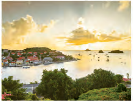
Land TEG1, 292m 2 Gustavia Land TEG2, 393m 2 5,800,000 € each lot

Newly built, turnkey, 5 bedroom villa at walking distance to the beach.