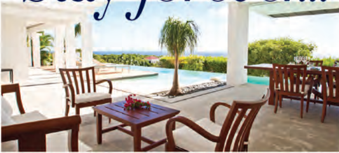
Villa BJJ - 3 Bedrooms - Gouverneur 8,900,000 €

Located within minutes of the beach and shopping. Two bedrooms are located in another pavilion, which opens to the pool area. The third bedroom is in a separate cottage with its own private terrace.