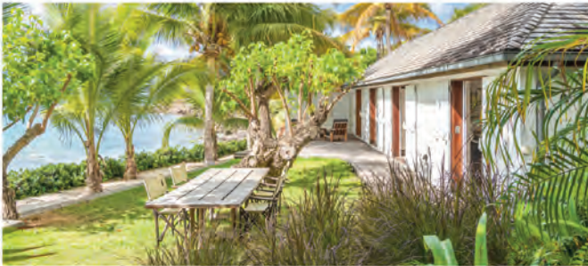
Villa MCL - 4 Bedrooms - Marigot 6,500,000 €

Minutes to beaches and shopping. Spectacular ocean views. Air-conditioned bedrooms. Possibility to build a third bedroom.