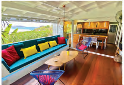
Apt SJD - 2 Bedrooms - St Jean 1,749,000 €

Designed and decorated by famed interior architect Christian Liaigre, this waterfront villa has direct access to Marigot Beach. The villa consists of three separate bungalows. Three private parking spaces.