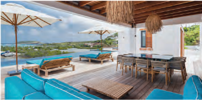
Villa HEM - 5 Bedrooms - Grand Cul de Sac 7,910,000 €

Ocean views, terrace with Jacuzzi, private parking. The apartment has an interior space of 61m 2 plus a 15m 2 terrace.