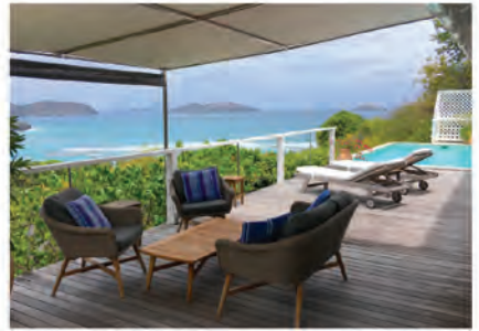
Villa MAG - 2 Bedrooms - Lorient 4,500,000 €

Located within minutes of the beach and shopping. Two bedrooms are located in another pavilion, which opens to the pool area. The third bedroom is in a separate cottage with its own private terrace.