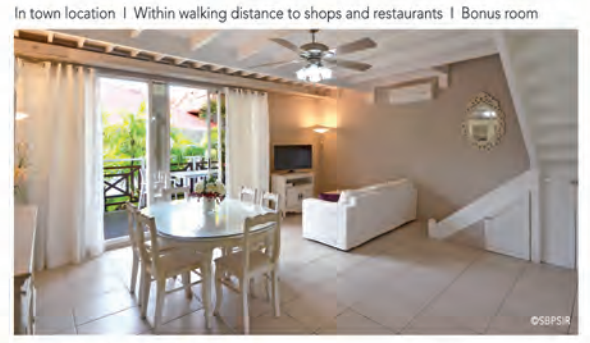
Condo | Gustavia 2 Bedrooms | 2 Bathrooms Price upon request

Gustavia Office: +(59) 0590 29 90 10 | USA: +1-508-570-4481