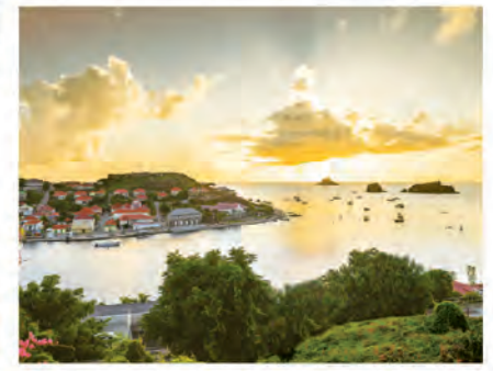
Land TEG 1, 292m2 Gustavia Land TEG 2, 393m2 5,800,000 € each lot Two lots, each with a possibility for a 3 bedroom villa. Or, combine the two for an exceptional larger property.

Ocean views, terrace with Jacuzzi, private parking. The apartment has an interior space of 61m<sup>2</sup> plus a 15m<sup>2</sup> terrace.