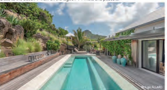
Private Villa | Grand Cul de Sac 3 Bedrooms | 3 Bathrooms Offered at: €4,750,000

Close to the beach | View on the lagoon | Private and peaceful