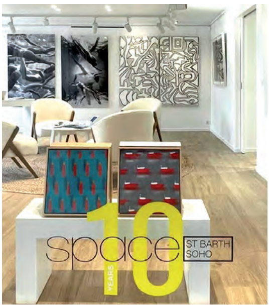
Installation view of artwork at the fresh new Space.