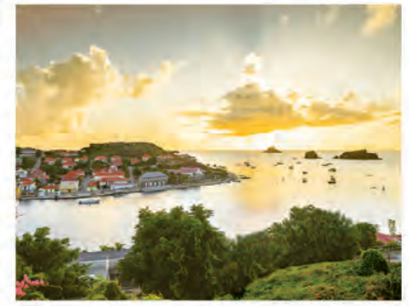
Land TEG 1, 292m2 Gustavia Land TEG 2, 393m2 5,800,000 € each lot Two lots, each with a possibility for a 3 bedroom villa. Or, combine the two for an exceptional larger property.

Ocean views, terrace with Jacuzzi, private parking. The apartment has an interior space of 61m<sup>2</sup> plus a 15m<sup>2</sup> terrace.