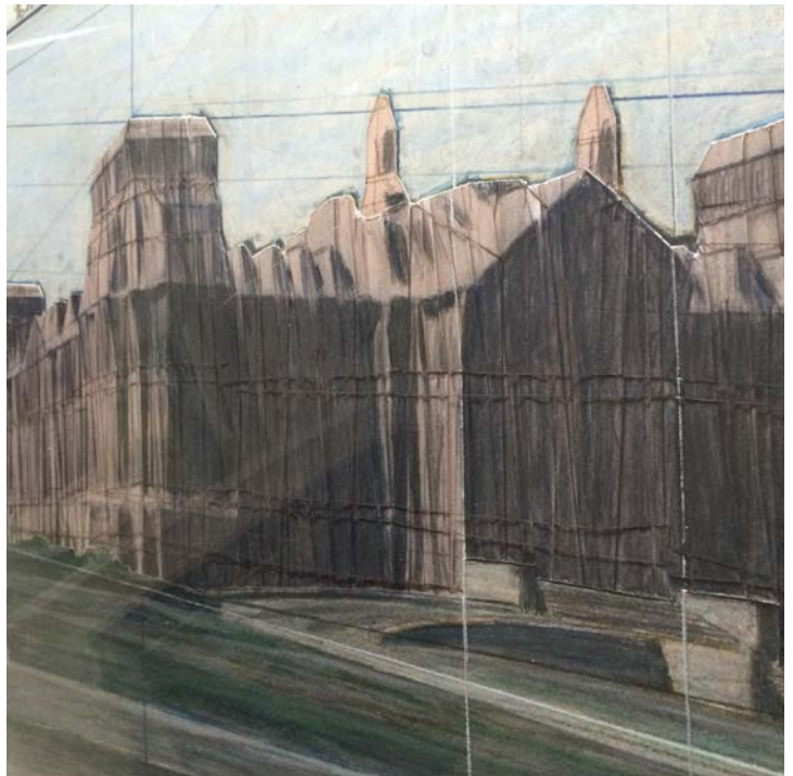
Christo: Wrapped Reichstag

Cover image: Scoglersi come Neve al sole - Boetti