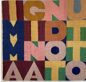
Imaginando tutto, Boetti

Textural Geographies showcases artists and artworks representative of several of the most influential Italian avant-garde movements of the twentieth century with a special emphasis on the artists' desire to push past the limitations of the two-dimensional plane. The artists all play with texture and different mediums to play with volume and depth of their works. Elaborating on this concept, Agostino Bonalumi