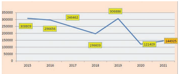
After a slow year in 2020, the overall number of passengers rebounded in 2021.

As for cruise ships, 2021 was even worse than 2020, which was already much weaker than 2019, with only 204 ocean liners in the