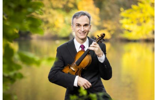
Eminent violinist Gil Shaham will perform in Saint Barth during the 39th edition of the Music Festival