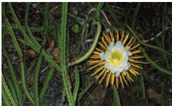
Selenicereus grandiflorus.

The thousands of photographs represent more than 2,100 illustrated taxa (that is to say taxonomic unities: the family, the genus, the species), including 1,602 animals and 545 plants, mushrooms, algae,