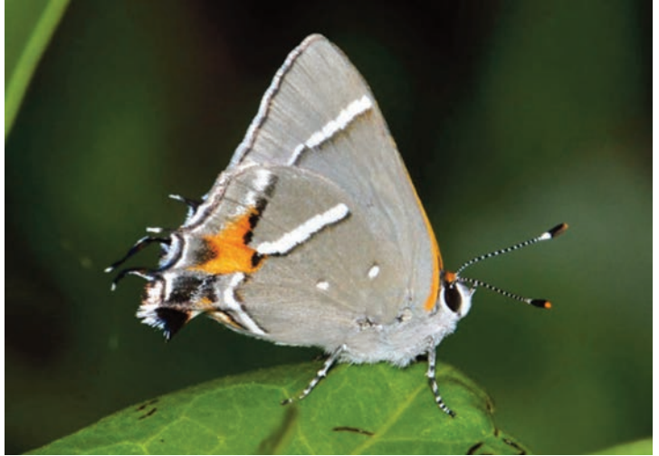
Strymon acis

and other examples. "It's the kind of guide where you must look carefully," says the author with modesty, as he continues the battle to properly organize the many species. "I classified the plants by physical categories and visual characteristics, with sub categories," he explains, finding that provided the simplest clarity. However, in perusing the guide, it is easy to see how quickly one can go down a rabbit hole.