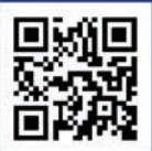
SCAN TO SEE THE EPROGRAM BOOK

Single tickets and season passes are available from January 2 – 6 at the Bureau of Tourism, on January 8th at the Gustavia Sunday Market, and at every concert venue door. No reservations necessary. Cash or local checks only.