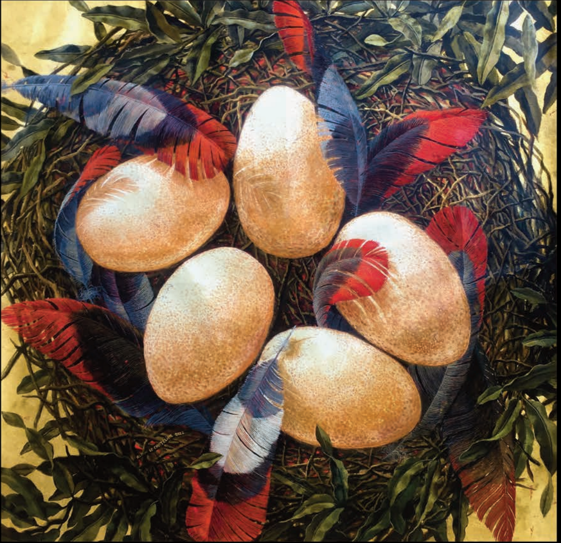
EXHIBIT FEBRUARY 3-MARCH 3, 2023

Meet the artist at the gallery every day from 5pm-7pm