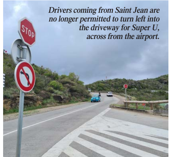
Drivers coming from Saint Jean are no longer permitted to turn left into the driveway for Super U, across from the airport.

For the moment, there are only a few modifications to the traffic patterns in St Barth. Yet these are a harbinger of things to come, as the new territorial council continues to improve the flow of traffic on the island's roads. The first change was new signage that informs all drivers of their speed as they descend the hill from Coupe Gorge toward the small traffic circle near Villa Créole in Saint Jean. There is also a new, solid white line that indicates a no-passing zone along the entire length of the curve where a 25-year-old on a quad was killed a few months ago.