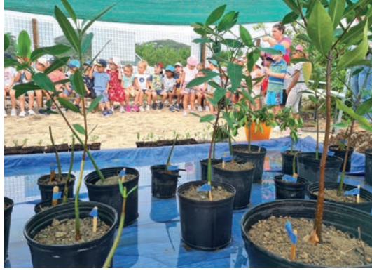
Two nursery school classes from Gustavia went on a nature trip, Monday morning, to visit the nursery for indigenous plant species by the pond in Grand-Cul-de-Sac.

On Monday morning, two classes from the Gustavia nursery school visited the mangrove nursery planted by the Deborah Brosnan environmental foundation in Grand-Cul-de-Sac. A great opportunity for the kids to get to know their environment.