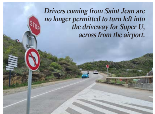
Drivers coming from Saint Jean are no longer permitted to turn left into the driveway for Super U, across from the airport.

To leave the road that leads to Super U, after respecting the Stop sign, drivers can turn left or right onto route 209A. These new rules are but temporary, as the Collectivité plans to create a new traffic circle to replace these intersections.