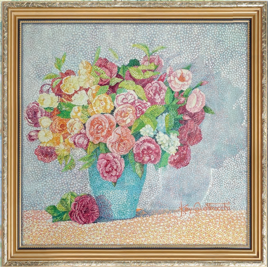
Les roses anglaises - oil on canevas - 100% lin www.kayquattrocchi.com

Published by Le Journal de Saint-Barth journalsbh@orange.fr