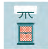
STAY IN PLACES WITH AIR CONDITIONING AND WINDOW SCREENS