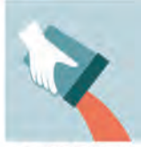
REMOVE STANDING WATER AT HOME