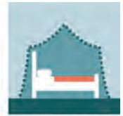
SLEEP UNDER A MOSQUITO BED NET

Dengue fever continues to persist in Saint Barthélemy. The virus, which was first detected in mid-September, became an epidemic over a month ago. An average of 90 new cases of dengue fever are reported each week (91 in week 49), with close to 30 emergency room visits at the De Bruyn hospital (29 in week 49, compared with 31 in the previous week). The number of people hospitalized is more variable. There were none in week 49, compared with four the previous week. Nevertheless, the situation remains constant, and the Regional Health Agency is maintaining the island at epidemic level 3. Since mid-September, over 700 clinical cases have been recorded by doctors, and more than 200 emergency room visits have been recorded. It should be noted that many people affected