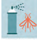
USE INSECT REPELLENT