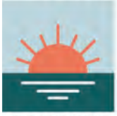
AVOID GOING OUT AT DUSK/DAWN WHEN MOSQUITOES ARE MORE ACTIVE