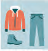
WEAR PROTECTIVE CLOTHES