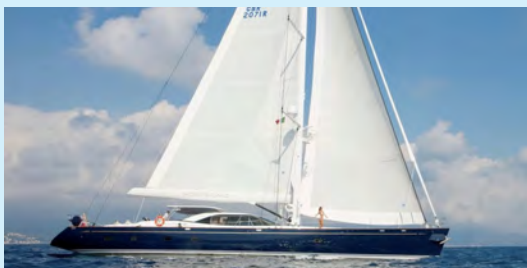
NOSTROMO Type : Sloop - Designer: Dubois - LOA: 30m Builder : Pendennis Shipyard - Launch : 2009