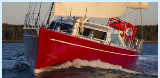
RED SKY Designer: Frers - LOA: 30m Builder : Nautor Swan - Launch : 2003