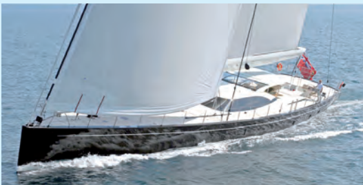
NINGALOO (PREVIOUSLY NAMED LADY B) Type : Sloop - Builder : Vitters Shipyard - Designer : Dubois - LOA : 45m - Launch : 2009