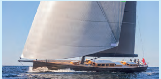
PERSÉVERANCE Type : Sail Yacht - Designer : Hoek Launch : 2020 Builder : Vitters - LOA : 50m