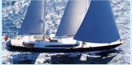
PANTHALASSEA Designer: Foster & Partners - LOA: 44m Builder : Perini Navi - Launch : 2010