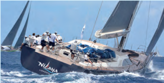
NILAYA Type: Sloop - Designer: Reichel Pugh- Launch: 2010 Builder : Baltic Yachts Ltd - LOA : 34m