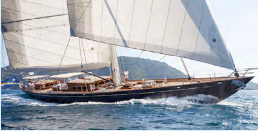
NAMUUN Designer: Hoek Design Naval - LOA: 33m Builder : Turquoise Yachts - Launch : 2012