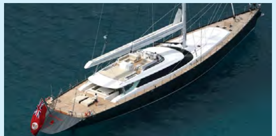
RED DRAGON Builder : Alloy Yachts - Designer : Dubois LOA : 52m - Launch : 2008